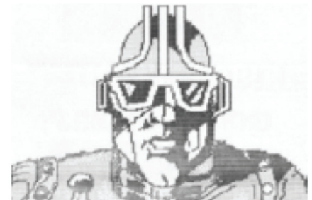
Message from Captain Irata:

Late comedian Don Knotts was also in an Atari commercial as well. He played an inmate in jail trying to escape from his cell.